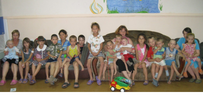
Children at the Opportunity House