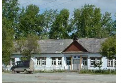
Transformation of the Leadership Training building bought by The Bridge in 2002

The building also contains a room for the training of the residents of the center, as well as for leaders and workers from other