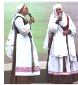
Walking past the campus of Vilnius University, we came across the Ms. World contest participants performing alongside with a duo singing folkore music. This symbolizes Lithuania today — caught between her past and her present, the East and the West. Who is she?

Lithuanians are considered an intellectual, artistic people who are proud of their nation and its heritage, boasting a 100 % literacy and the largest number of