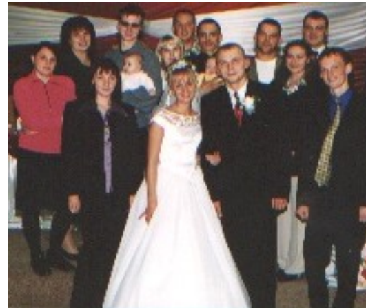
Many three-fold chords have been intertwined