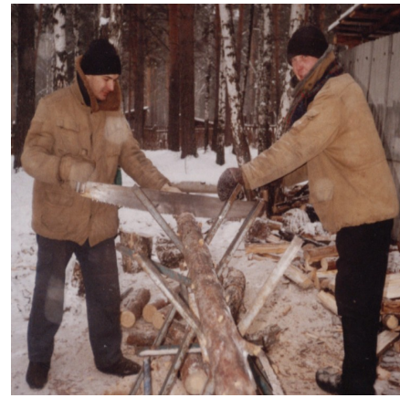
The forest has great resources