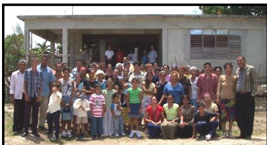
Cuba: It takes $300 to adapt home into church building!

God's most important and powerful agency on earth, is undoubtedly the Church, served and lead by men and women guided by the Power of the Holy Spirit.