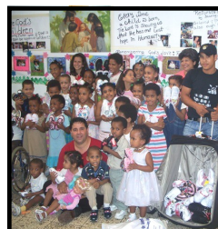
Orphaned "Crystal Kids" in the Dom. Rep. dying from living on toxic waste dumps, which has caused their bones to turn liquid (left and below).